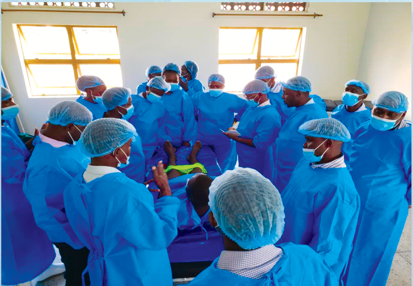
Trainer taking the participants through a practical session at Kirima HCIII

Against this background, USAID LPHS Kigezi & Lango Activity in collaboration with Makerere University Walter Reed Project (MUWRP) recently conducted a 7 days hands on skills Shang Ring training for 39 health workers (circumcisers, assistant circumcisers and SMC counsellors) using the recommended MOH Uganda standard curriculum.