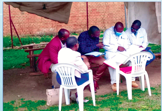
SIMS assessment at Kihihi HC IV

harmonious implementation of activities and improved performance. The weekly DHO debrief meetings and communication ensured timely update on running activities for better coordination, participation and successful implementation leading to better outputs” Karungi Honest; ADHO-MCH/ AP3/ Munonye Focal person.