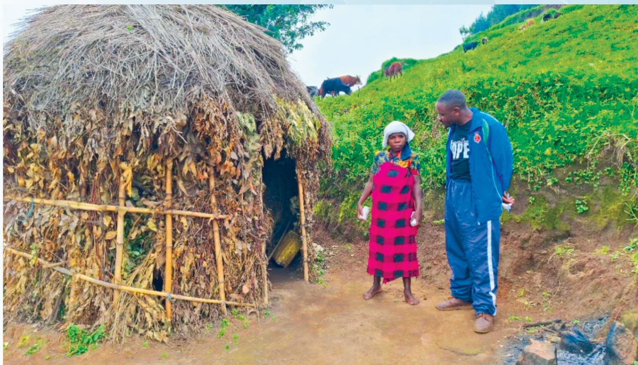
A counsellor visits a home in the Batwa community

As part of inclusive development, the activity works with marginalized communities of the Batwa in Kigezi region. Through enhanced availability, accessibility, and promotion of high-quality TB/HIV services, Kigezi has significantly bolstered support for marginalized communities within the Kanungu, Rubanda, and Kisoro districts. The project serves Batwa in 14 facilities across 3 districts with ART refills, viral load monitoring, TB preventive therapy, index client partner testing, gender-based violence (GBV) screening, as well as vital psychosocial and Orphaned and Vulnerable Children (OVC) support.