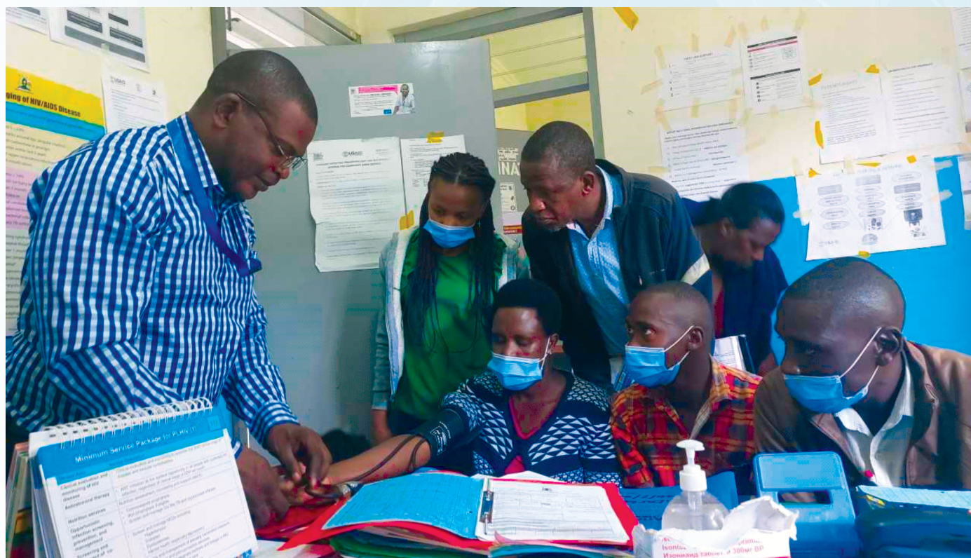
Practical demonstration on taking blood pressure during a coaching session at Kisoro Hospital

The USAID LPHS-Kigezi and Lango Activity worked with district health teams and health facility staff to fast-track training, on-job mentorship and coaching, provision of essential equipment and SOPs, tracking implementation and continuous improvement. This is in line with Ministry of Health strategy of integrating screening and management of non-communicable diseases (NCDs) among persons living with HIV attending ART and PMTCT clinics. The 2022 consolidated guidelines for Prevention and Treatment of HIV in Uganda recommend screening and management of non-communicable diseases including Hypertension (HTN), Diabetes mellitus (DM) and Mental health disorders (especially depression and anxiety and alcohol/substance abuse) as part of routine clinical assessment at every clinical encounter.