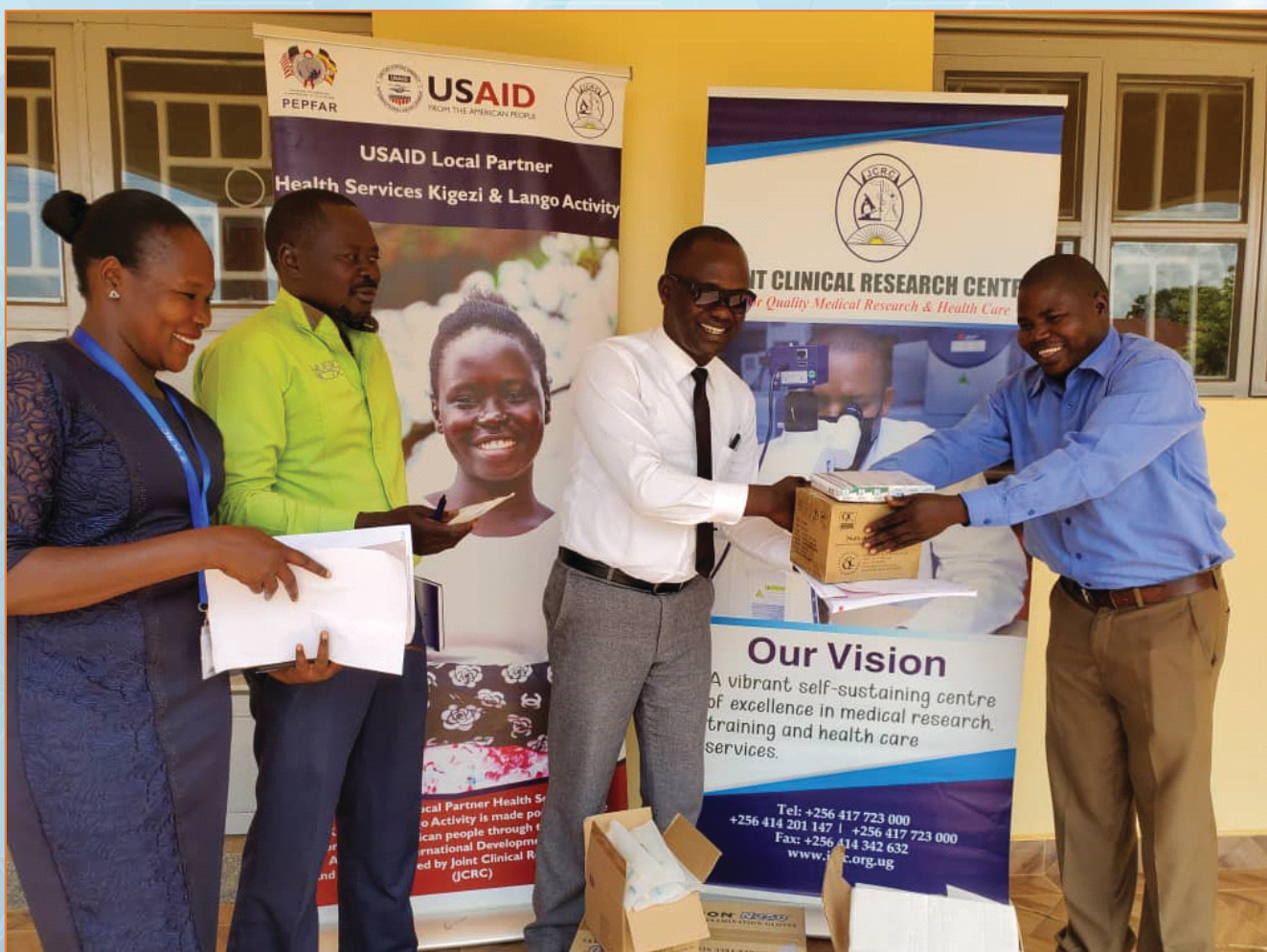
The Supply Chain Advisor handing over medicines to the CAO Kole district

JCRC through its partners Direct Relief secured medicines and commodities worth over 188 (One Hundred and Eighty-Eight) million Ugandan shillings on humanitarian aid organization that was meant to equip health professionals in resource-poor communities to meet the challenges of diagnosing and caring for people in need. These included Antihypertensive medicines, antibiotics, IV fluids, antidepressants, oral rehydration solutions, and vitamins for pregnant mothers. These medicines will complement the drugs that facilities receive through the National Supply Chain System and are expected to contribute to improving the quality of patient care and treatment.