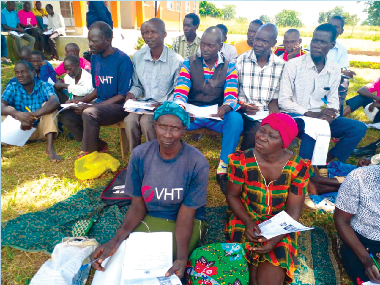
TB CAST+ Community Screening at Abia HC II.

The activity in conjunction with MoH implemented an integrated CAST+ campaign focusing on TB, HIV, malaria, nutrition, sanitation, and hygiene. Through this campaign in March 2024, 13,677 (9,486 in Lango, 4191 in Kigezi) people were screened for TB and 107 TB cases were identified and treated (83 in Lango and 24 in Kigezi). Through the integration, 2,865 children and adults (2,287 in Lango and 578 in Kigezi) also received nutrition assessment, 688 malaria cases in Lango were treated among others.