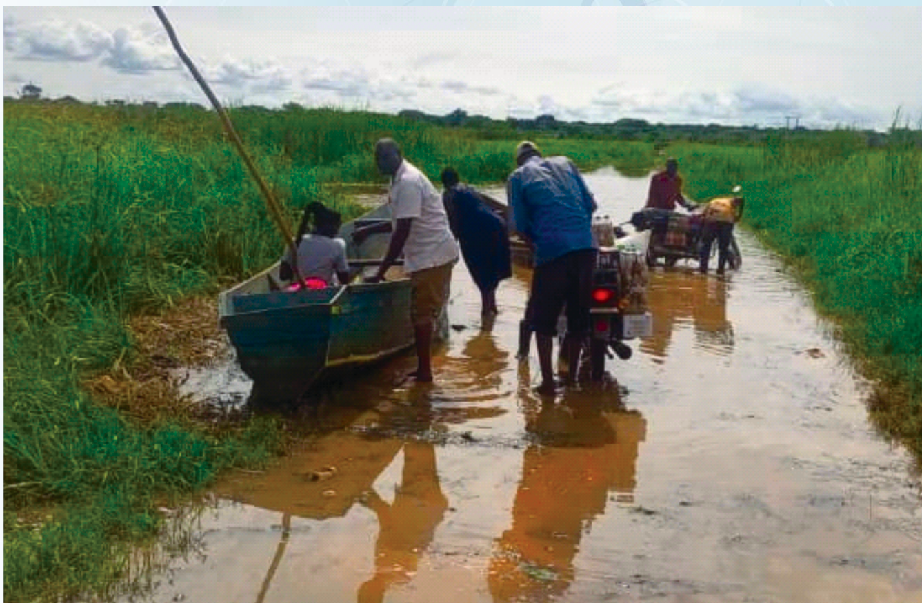
Targeted hotspot testing at Muchora island in Acii parish, Namasale town council.

Our efforts strive to support health facilities and provide index testing services to all PLHIV eligible for the services in targeted hotspots. At Acii HCIII, the team identified 2 islands with low coverage of HIV testing services. These sites were previously only reached with immunization services for children. This activity was carried out at Muchora Landing Site in Acii Parish, and 51 clients were tested for HIV, among which 4 people were identified as HIV positive and linked to ART.